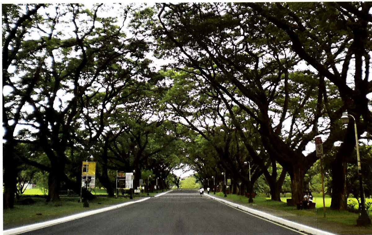
The fabled academic oval of UP Diliman provides the iskolar ng bayan the much need shelter from the scorching sun during summer.