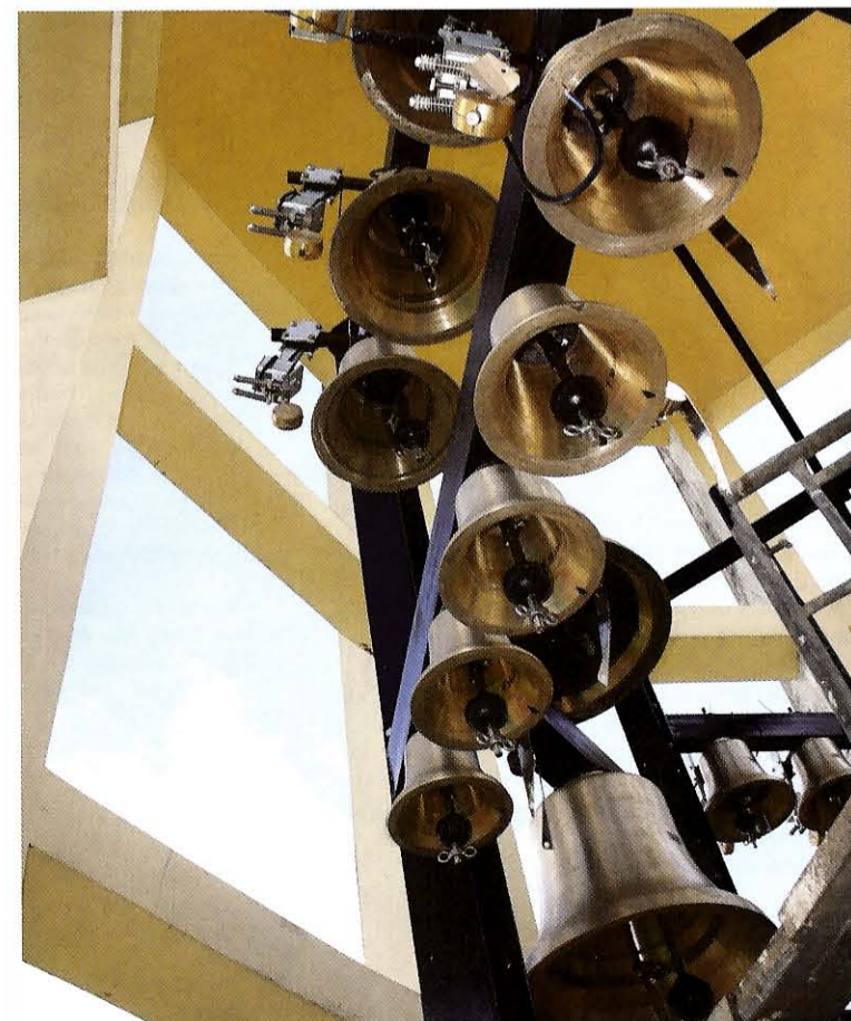
For many UP alumni, the University Hymn, whether in the English or Filipino version, becomes etched in their hearts, largely due to the chiming of the tune on campus by the carillon bells before sundown everyday.