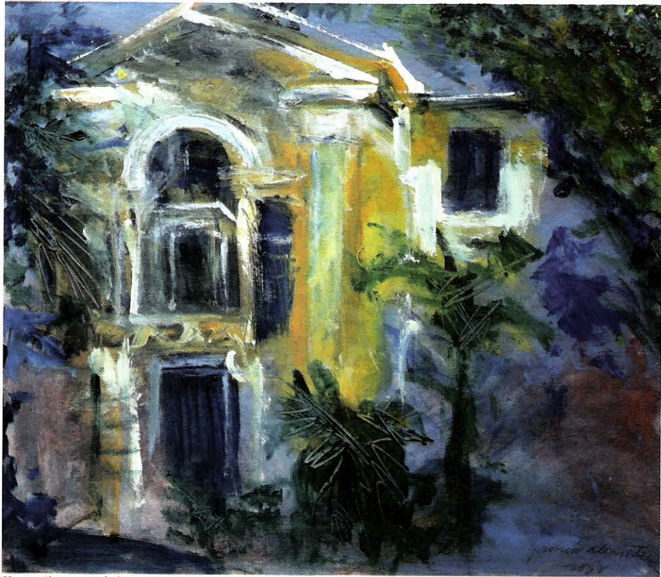
Yasmin Almonte, Malcolm Hall , 2008