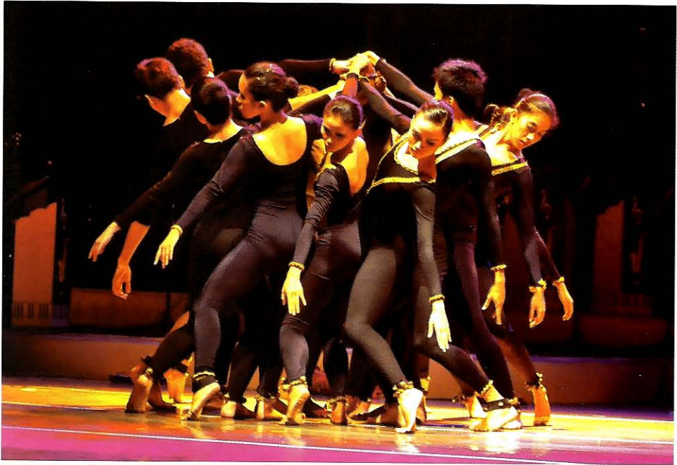
UP Dance Company

Featured performing groups are the UP Pep Squad, the UP Street Dance Club, the UP Filipiniana Dance Group, the UP Dance Society, the UP Dance Company, the UP Symphonic Band, the UP Kontra Gapi and the UP Perc Ensemble.