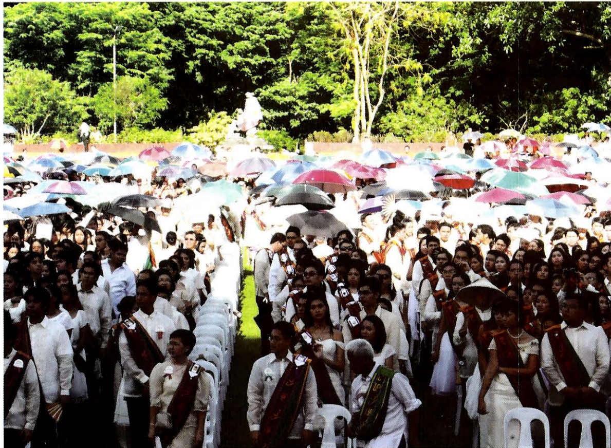
Multi-colored umbrellas and other forms of head cover shield the candidates for graduation and the audience from the baking sun of summer during the annual commencement rites in UP Diliman.

Schedules subject to change without prior notice. For confirmation of program schedules, please call OICA at 928-1928.