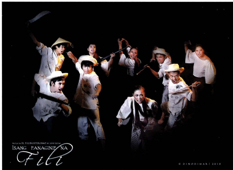
Cast of Isang Panaginip na Fili , DUP.

Isang Panaginip na Fili runs from November 24 to December 12 at the Wilfrido Ma. Guerrero Theater, UP Diliman, Quezon City.