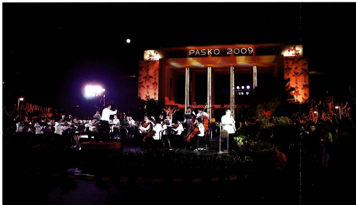
Quezon Hall: Pasko 2009