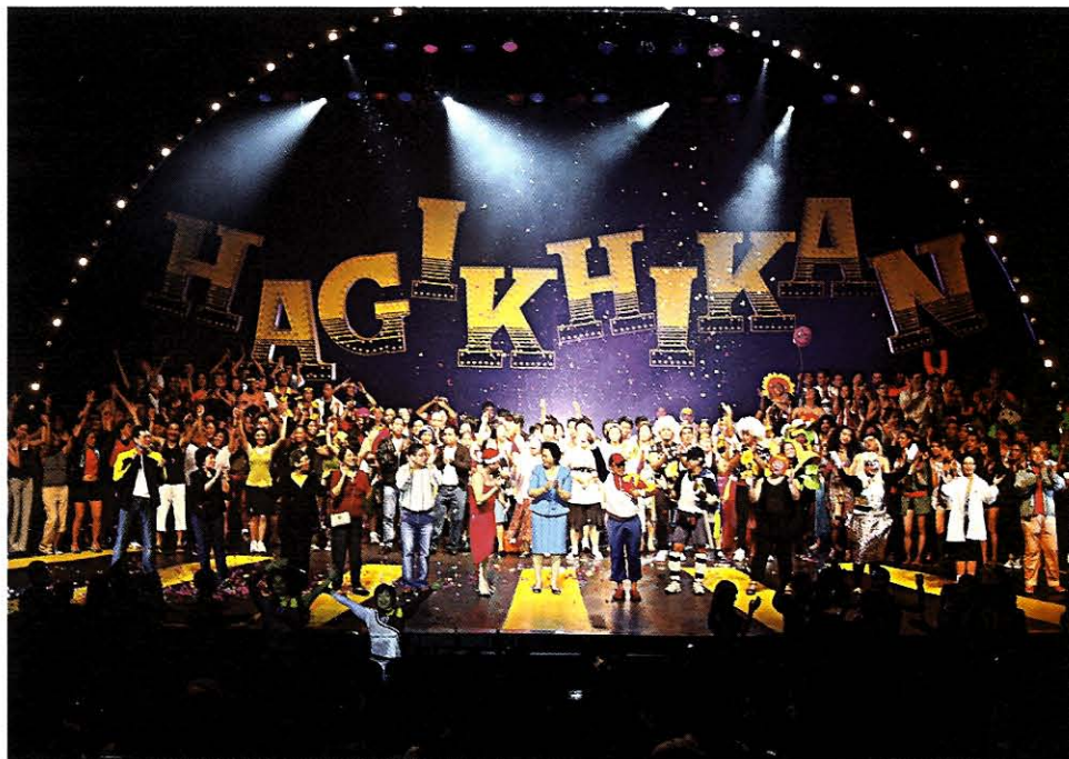
Hagikhhikan 2009 finale.

Hagikhhikan 2010 is expected to be bigger with the participation of two new academic units: the College of Education and the School of Library and Information Science. They join the other 14 units which participated in last year's follies namely: Asian Center, Asian Institute of Tourism, the Colleges of Architecture, Arts and Letters, Engineering, Fine Arts, Home Economics, Human Kinetics, Mass Communication, Music, Science, Social Sciences and Philosophy, Social Work and