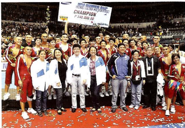
UP PEP Squad

Hot on the heels of Pep's victory is the tankers championship in both the men's and women's categories.