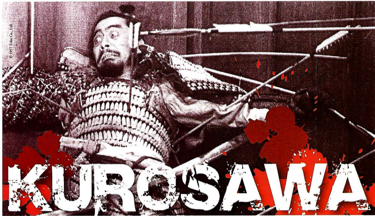
Kurosawa Film Festival at Cine Adarna.