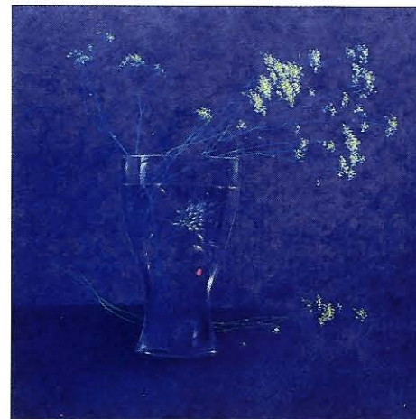
Lina Llaguno-Ciani, Crystal Vase

An early evening music concert follows the conference