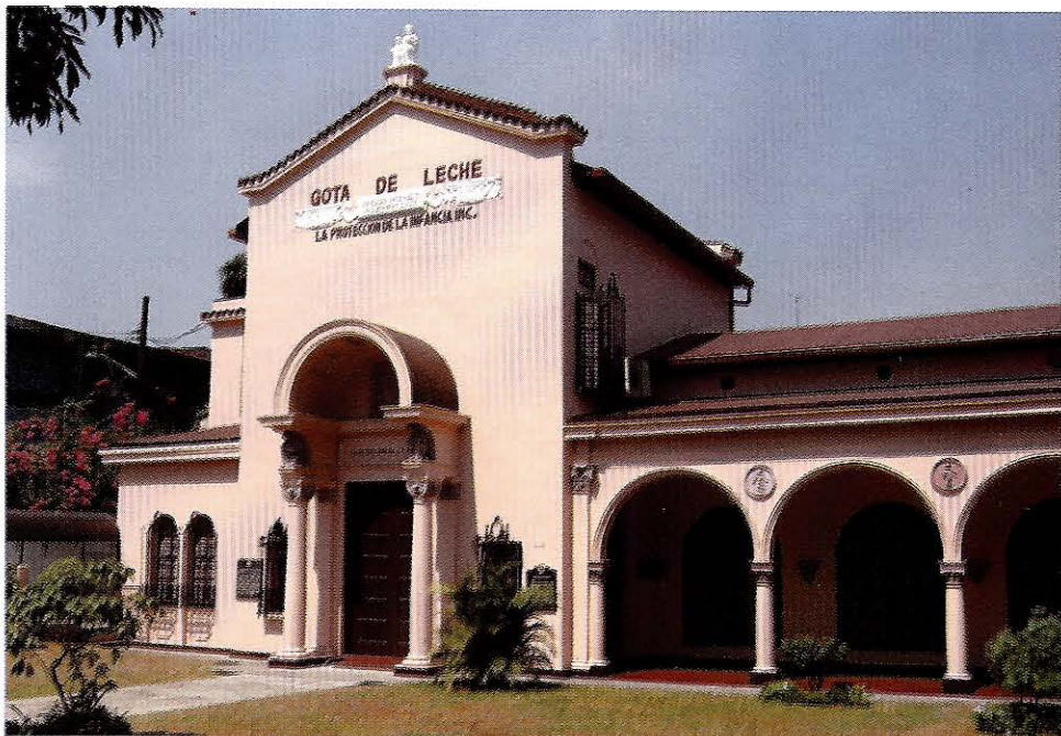
Gota de Leche in Sampaloc, Manila resonates Brunelleschi's Ospidale in Florence, Italy.