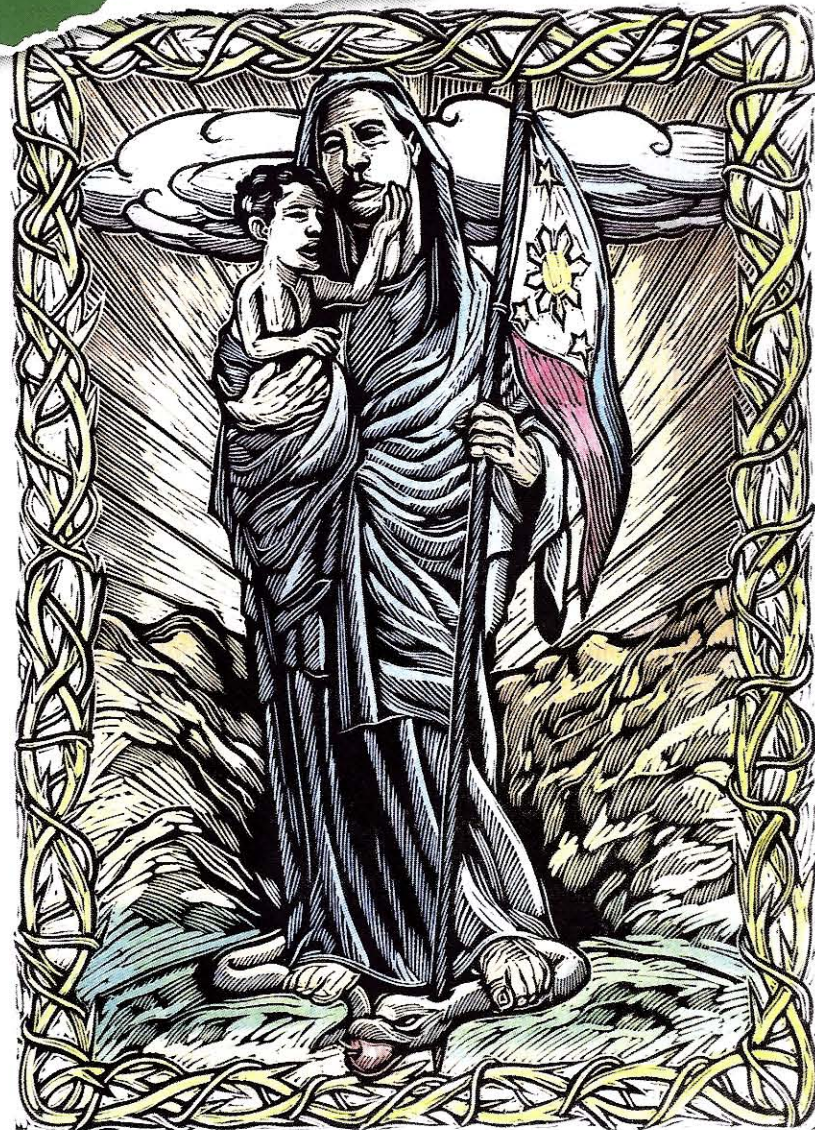
Leonilo Doloricon, Madre Filipina , rubber cut, 2010