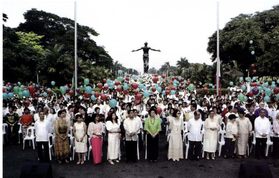
UP Centennial Foundation Day, June 18, 2008.