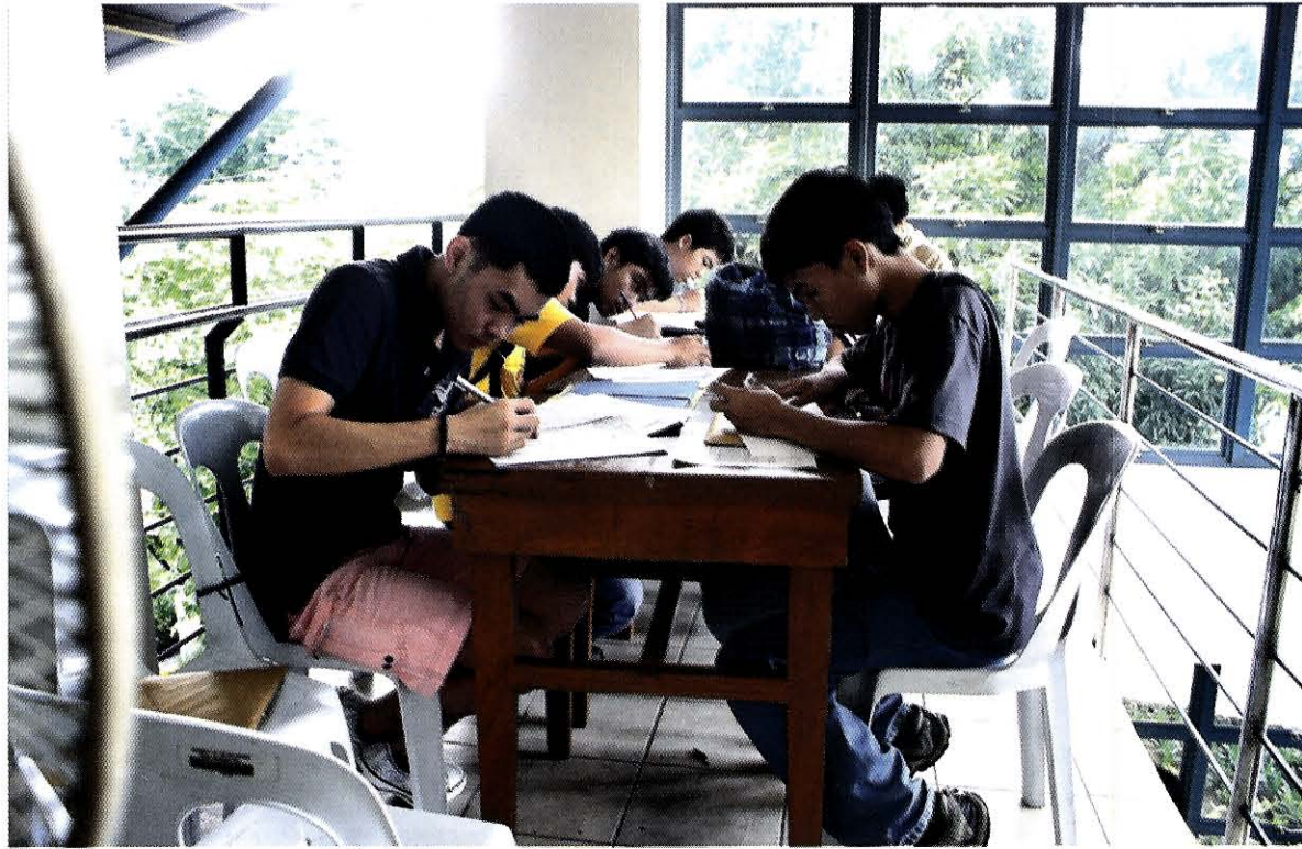
Freshies fill out their Form-5 during the advanced registration for freshmen at the Office of the University Registrar.